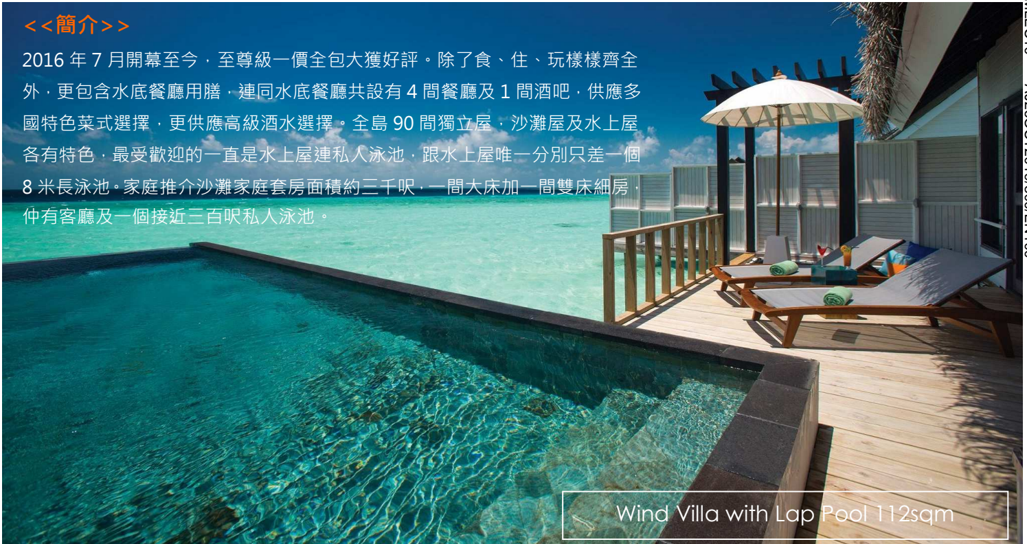
Wind Villa with Lap Pool 112sqm

2016年7月開幕至今，至尊級一價全包大獲好評。除了食、住、玩樣樣齊全外，更包含水底餐廳用膳，連同水底餐廳共設有4間餐廳及1間酒吧，供應多國特色菜式選擇，更供應高級酒水選擇。全島90間獨立屋，沙灘屋及水上屋各有特色，最受歡迎的一直是水上屋連私人泳池，跟水上屋唯一分別只差一個8米長泳池。家庭推介沙灘家庭套房面積約三千呎，一間大床加一間雙床細房，仲有客廳及一個接近三百呎私人泳池。